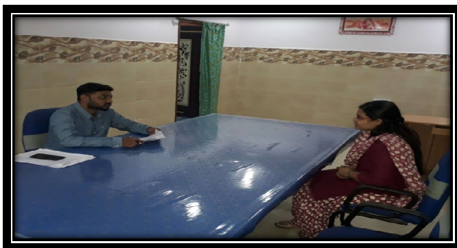
JOB SEEKER FACING TECHNICAL ROUND WITH OMICS REPRESENTATIVE

The required suggestions and remarks about infrastructure and other facilities are conveyed to the Principal for further improvement.