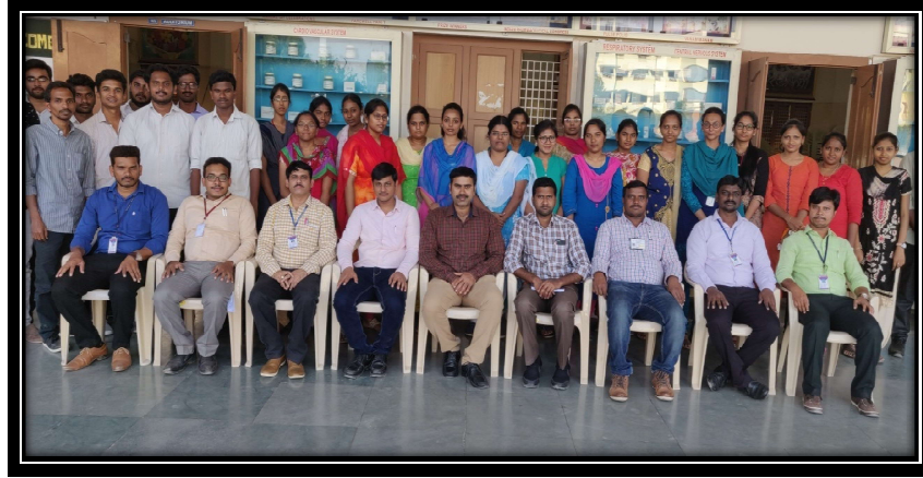
GROUP PHOTO SESSION WITH SELECTED CANDIDATES OF DIVIS RESEARCH CENTRE

Ph: 08645-236255, 236722, 9912342142 E-mail: ncpa_csagp@yahoo.co.in Web site: www.ncpacsag.ac.in