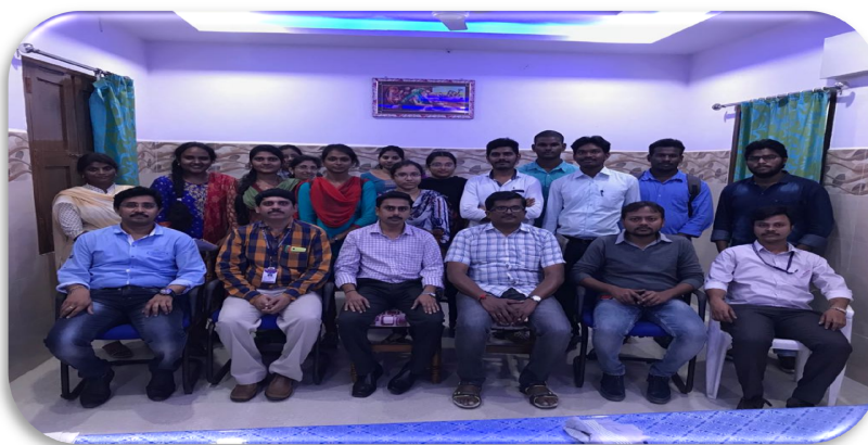
GROUP PHOTO SESSION WITH SELECTED STUDENTS OF EXCELRA

The required suggestions and remarks about infrastructure and other facilities are conveyed to the Principal for further improvement.