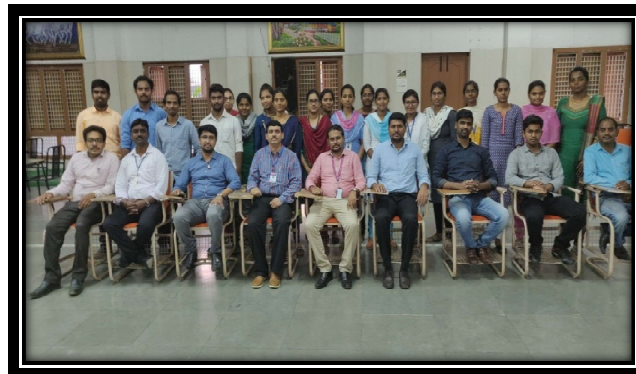
GROUP PHOTO SESSION WITH SELECTED CANDIDATES OF DOCTUS SOLUTIONS

The required suggestions and remarks about infrastructure and other facilities are conveyed to the Principal for further improvement.